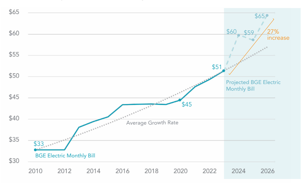
*Note: A customer may use more or less than 1,000 kwh/month. Rates in 2024 include a "reconciliation adjustment," an aspect of the MRP that allows BGE to charge ratepayers for spending in 2021 and 2022 that exceeded the originally approved rates. 2025 and 2026 do not include reconciliation adjustments that may be imposed in the future.

Electric Monthly Bill for Customer Using 1,000 kWh/month, 2010 to 2026